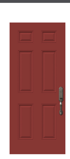
Shown in Benjamin Moore Red Oxide 2088-10