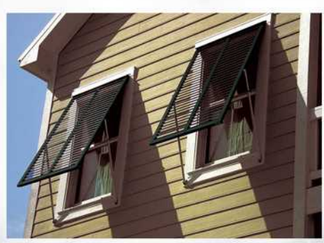
HELPS YOUR HOME EVERYDAY! 20 STANDARD COLORS Custom Colors Available

Bertha<sup>™</sup>HV<sup>™</sup> Bahamas come in a wide variety of choices. All of them provide unmatched beauty and energy savings. Some are for shade and decorative purposes only, while other provide Code approved Hurricane protection. Reduce your electric bill while adding decorative flair!